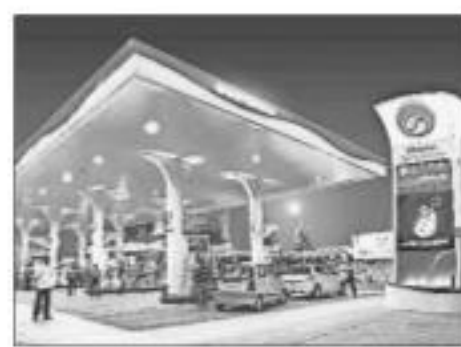
Affirming BPCL's rating at 'BBB-' with a negative outlook, Fitch said it continues to treat the potential divestment of the company by the government as an event risk

"We believe the risks of further COVID-19 waves and global oil and gas companies' increased focus on energy transition lead to additional uncertainty over the timing and val-